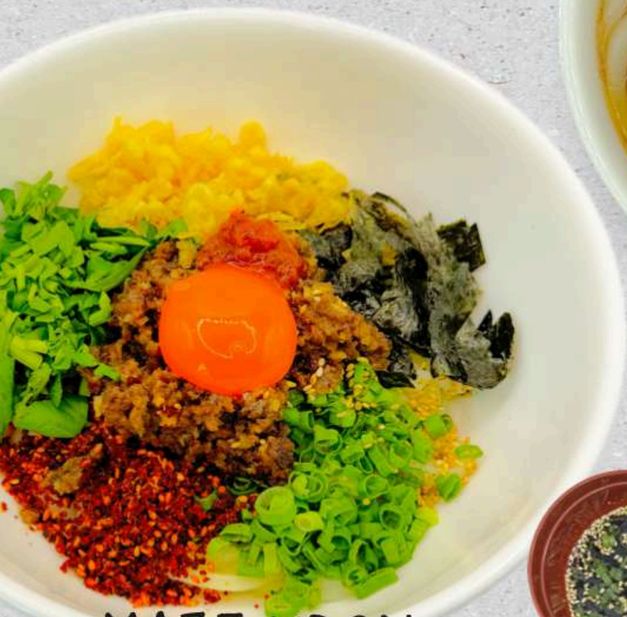
MAZE UDON WAGYU BEEF MIXED UDON