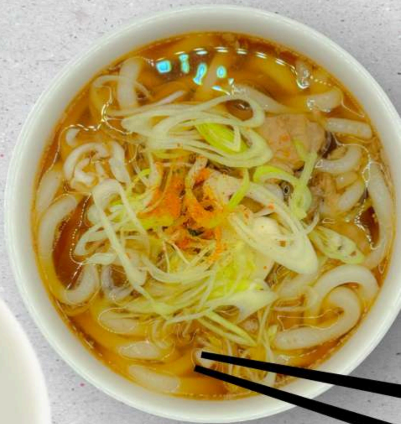
NIKUSUI UDON BEEF TENDON UDON